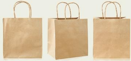
paper bag 종이 백