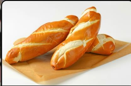
a loaf of bread 빵 한 덩어리