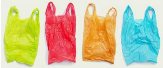
plastic bag 비닐 봉지

Words Used for Packaging: 포장할 때 사용되는 재료들