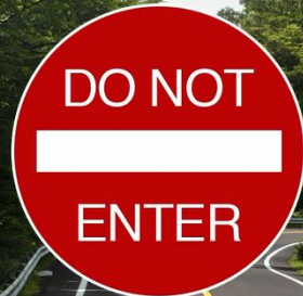
Do not enter 들어가지 마시오