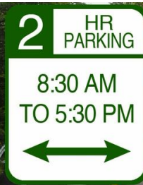
2 hours parking 2시간 동안 주차 가능