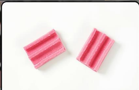
a pack of chewing gum 껌 한 통