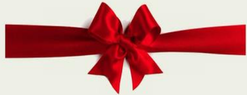
gift ribbons 선물 리본