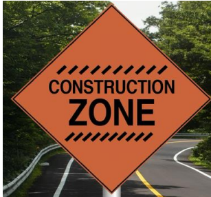
construction zone 공사 구역