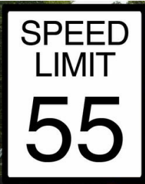
speed limit 55 속도 제한 55마일