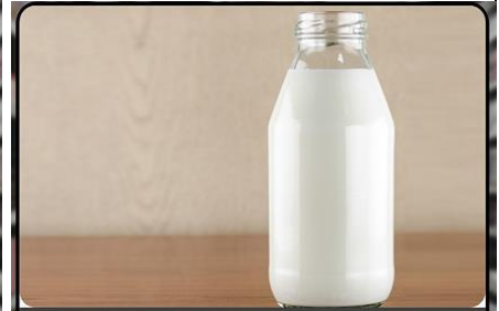
a carton of milk 우유 한 통