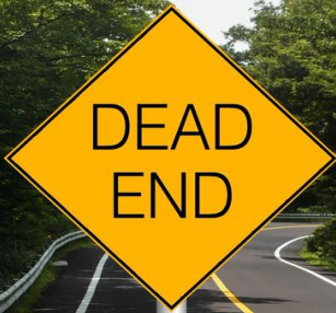
dead end 막다른 길