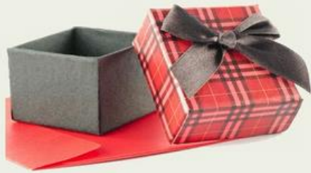
gift box 선물 상자