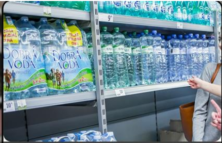
a bottle of water 물 한 병