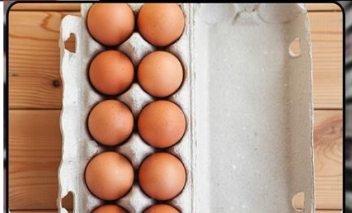
a dozen of eggs 한 다스의 계란